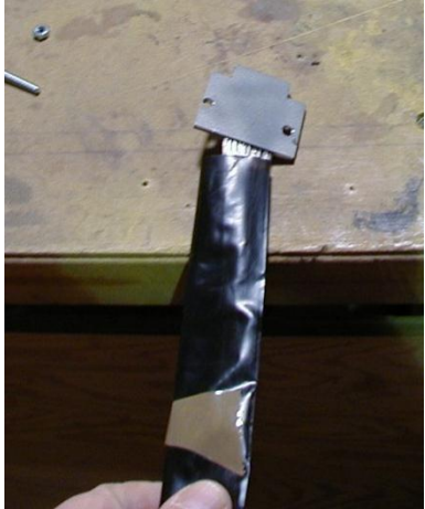
Fiber Optic Harness