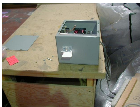
View of Fiber Harness Receptacle