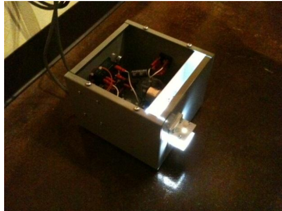
Lit Up View 2