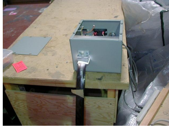
View of Harness in Receptacle